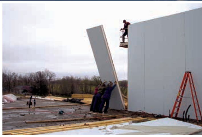
SIPs tilt-up panel

Beauty within a budget. The best of both worlds with an EPS Solid Core parlor. Tilt-up panels speed up building completion. All combined with moisture resistance and better R-Values.