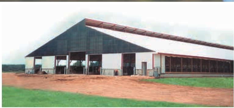
Offset ridge for maximum ventilation