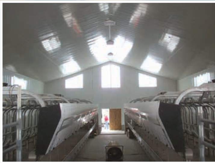
USDA-accepted interior finished panels and ceiling